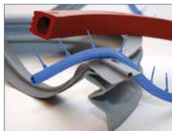
ELASTOMER SEALS AND PROFILES