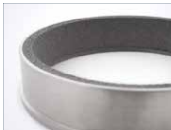
FELTMETAL™ ABRADABLE SEALS