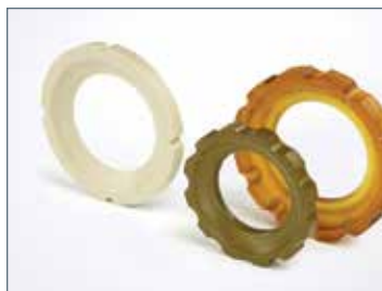
PTFE & OTHER POLYMER COMPONENTS