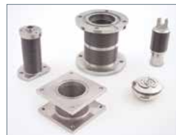
BELFAB® BELLOWS AND ASSEMBLIES