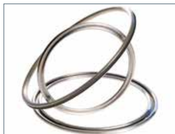
HELICOFLEX® SPRING ENERGIZED SEALS