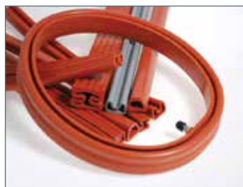
CEFIL'AIR® INFLATABLE SEALS