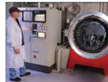
SPECIAL PROCESS SERVICES