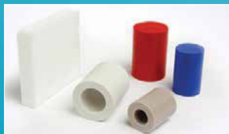
PTFE SHAPES MOLDING