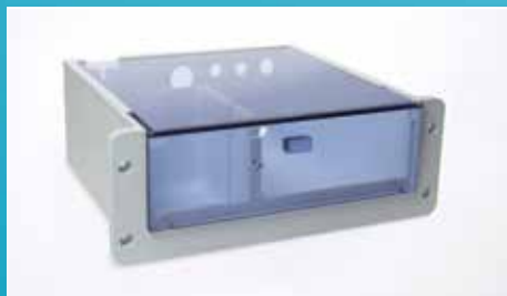
PLASTIC FABRICATION AND ASSEMBLIES