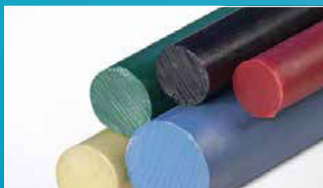
HIGH PERFORMANCE POLYMER SHAPES