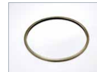
C-FLEX™ METAL SEALS