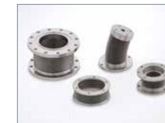
BELFAB® CUSTOM EDGE-WELDED METAL BELLOWS