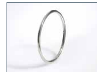
O-FLEX™ METAL SEALS