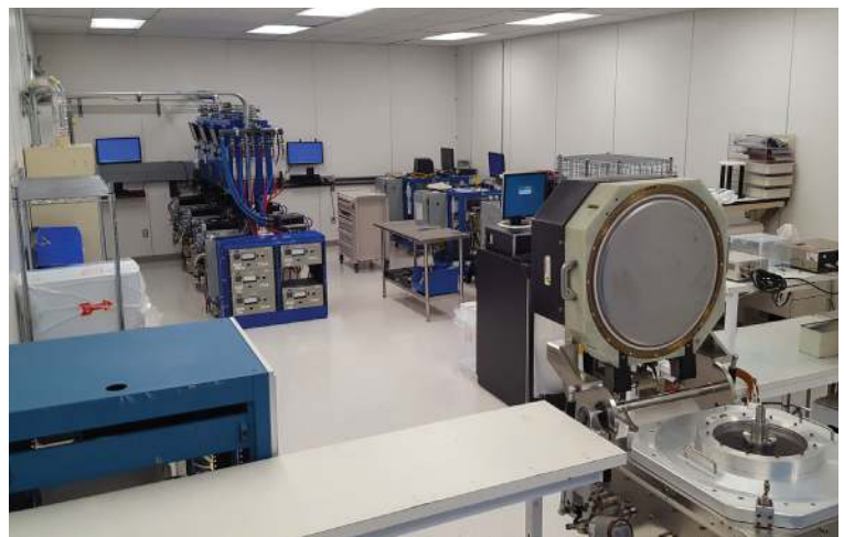
Class 1000 Clean Room